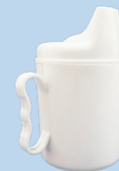
200ml Spouted Beaker Cup

A fluid volume ready reckoner to with fluid balance chart completion.