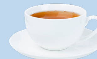
150ml Tea Cup