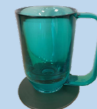
160ml Dysphagia Cup