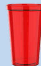
180ml Plastic Cup