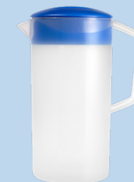
1000ml Water Jug