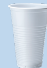
150ml Plastic Cup