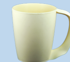
200ml Dysphagia Mug